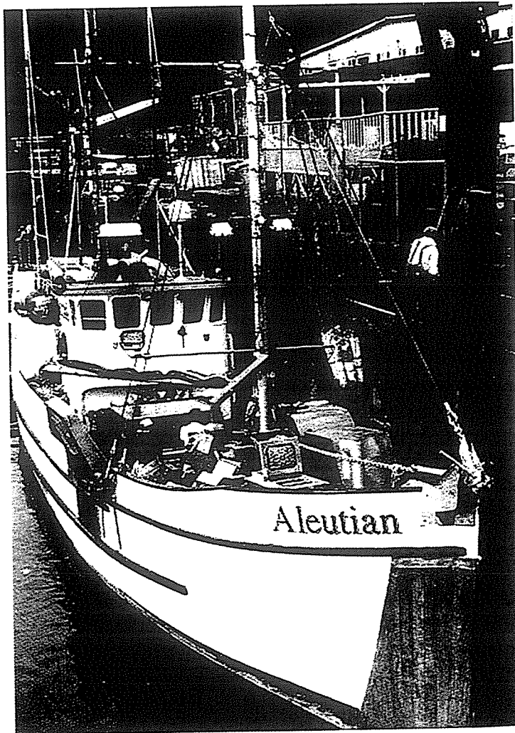
Typical Pacific halibut longlining fishing vessel

As early as the 1930s, the fishery was developing as a part-time fishery and a substitute fishery for vessels that participated in other fisheries. Vessels with trawls and purse seines were adapted to fish halibut with longlines. During the 1930s and 1940s, several small salmon trollers and gillnetters entered the fishery, targeting halibut during slow salmon seasons. By the 1960s, halibut stocks were thought to be in decline, prompting the IPHC to lower catch limits. In the 1970s, increases in the price of halibut, together with implementation of limited entry programmes in the salmon fisheries, stimulated greater entry of small vessels to the halibut fishery. During the 1980s, the fishery experienced an influx of many larger vessels from crab fisheries as crab stocks declined (IPHC 1987). The obvious implication from this history is that, for much of its existence, the commercial Pacific halibut fishery has been a supplemental fishery, attracting vessels from other fisheries during slow seasons or periods of stock declines. The attractiveness of the fishery as a supplemental