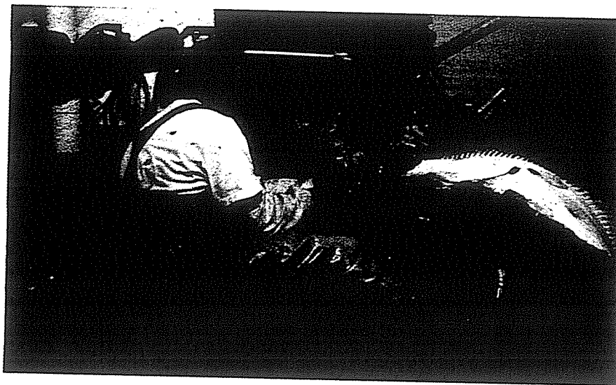
Catch and gear retrieval, Pacific halibut

Before 1995, when IFQ 8 systems in the fixed-gear halibut and sablefish fisheries off Alaska were instituted, both fisheries were subject to a common-property regime in which the total catch was controlled using TAC limits and seasonal limitations. Vessel registration and fishing permits, the only requirements to participate in the fisheries, were not limited and were available for nominal fees. Consequently, entry was essentially cost-free to fishers