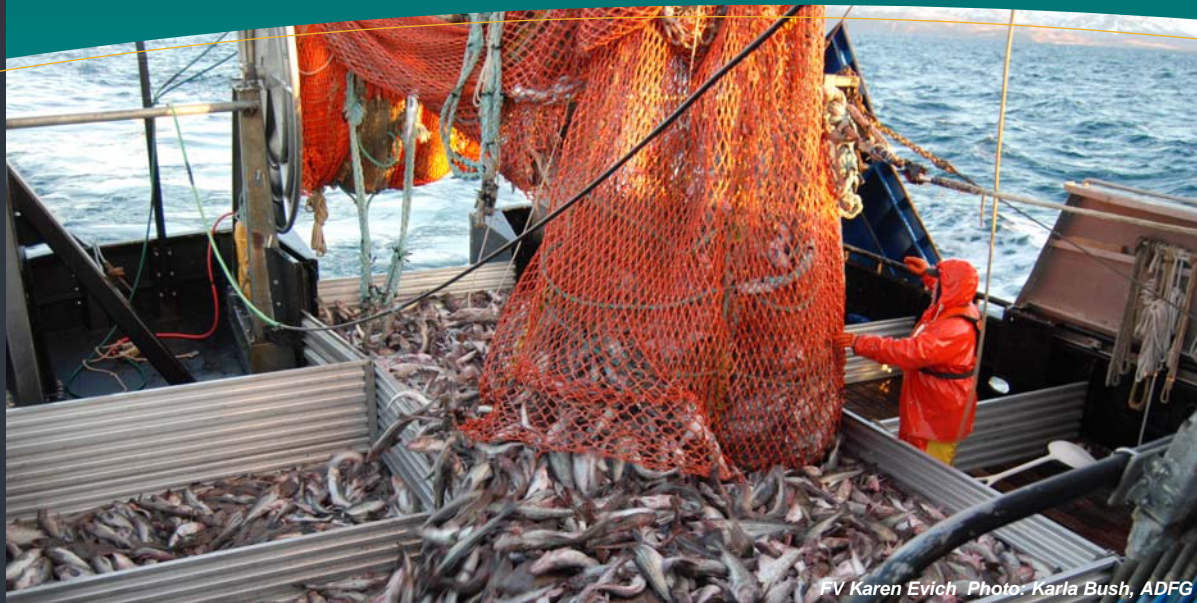
FV Karen Evich

The Council would like to thank the Midwater Trawlers Cooperative and the many generous industry co-sponsors who contributed to the reception given during the Council meeting. Delicious seafood was enjoyed by all.