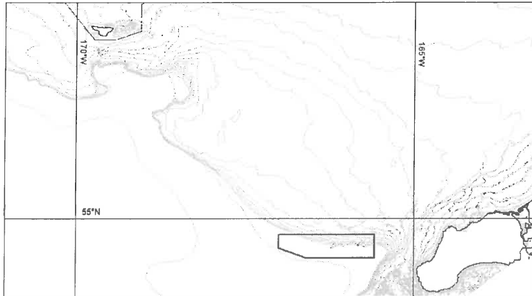
Figure 2. Chinook Conservation Area

There were no violations of the CCAA in 2017.