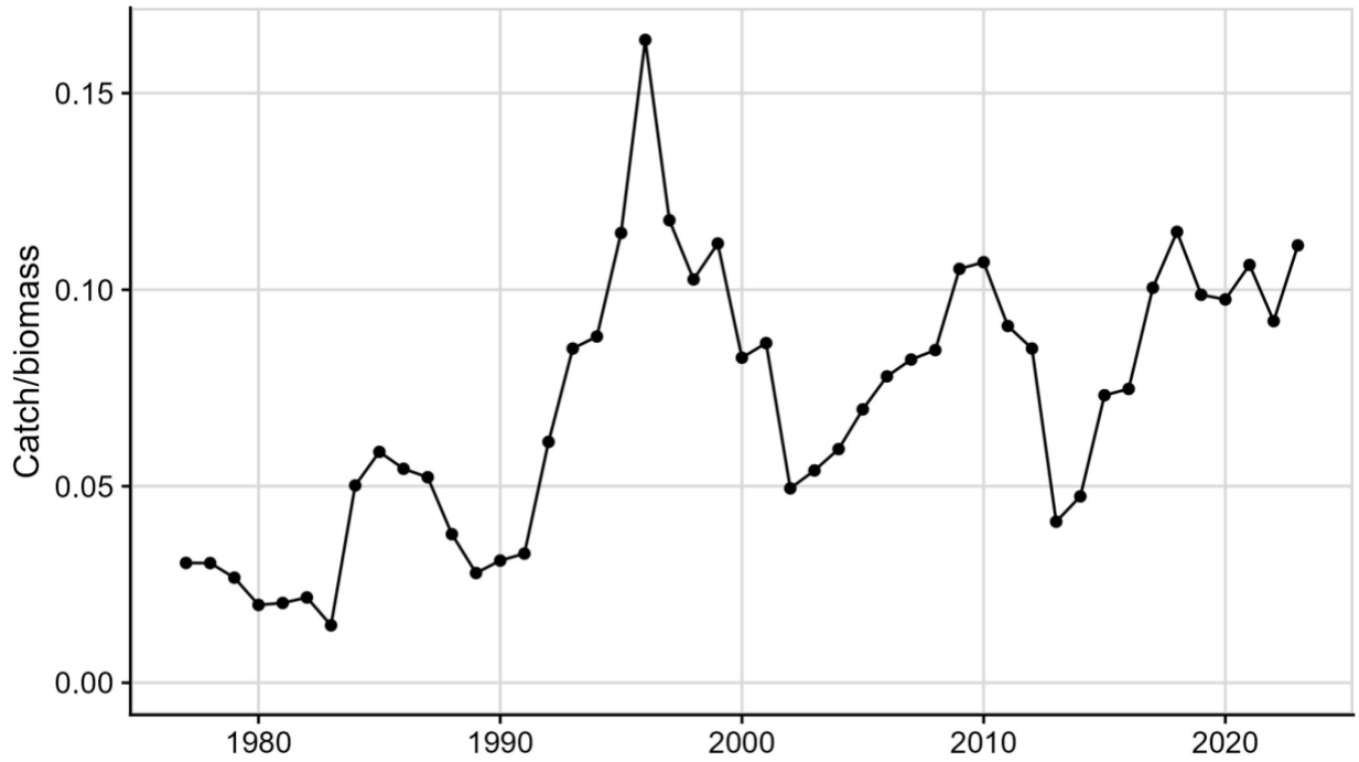
Figure 1. Modeled catch (t) divided by modeled total (age-1+) biomass (t), where estimates for 1977-2021 come from the 2022 assessment model and estimates for 2022 and 2023 come from the projection model.