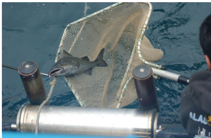
Crew members on the longline survey net a sablefish to be tagged.

To help improve communication and increase dialogue between scientists and members of the industry, we have started this informative newsletter. We hope to include any relevant research, links to new literature, summarized highlights of both Groundfish Plan Team and NPFMC meetings, and general news that may have an effect on those involved with the sablefish fishery. Please feel free to pass on, or send us email addresses of others who may appreciate receiving these newsletters.