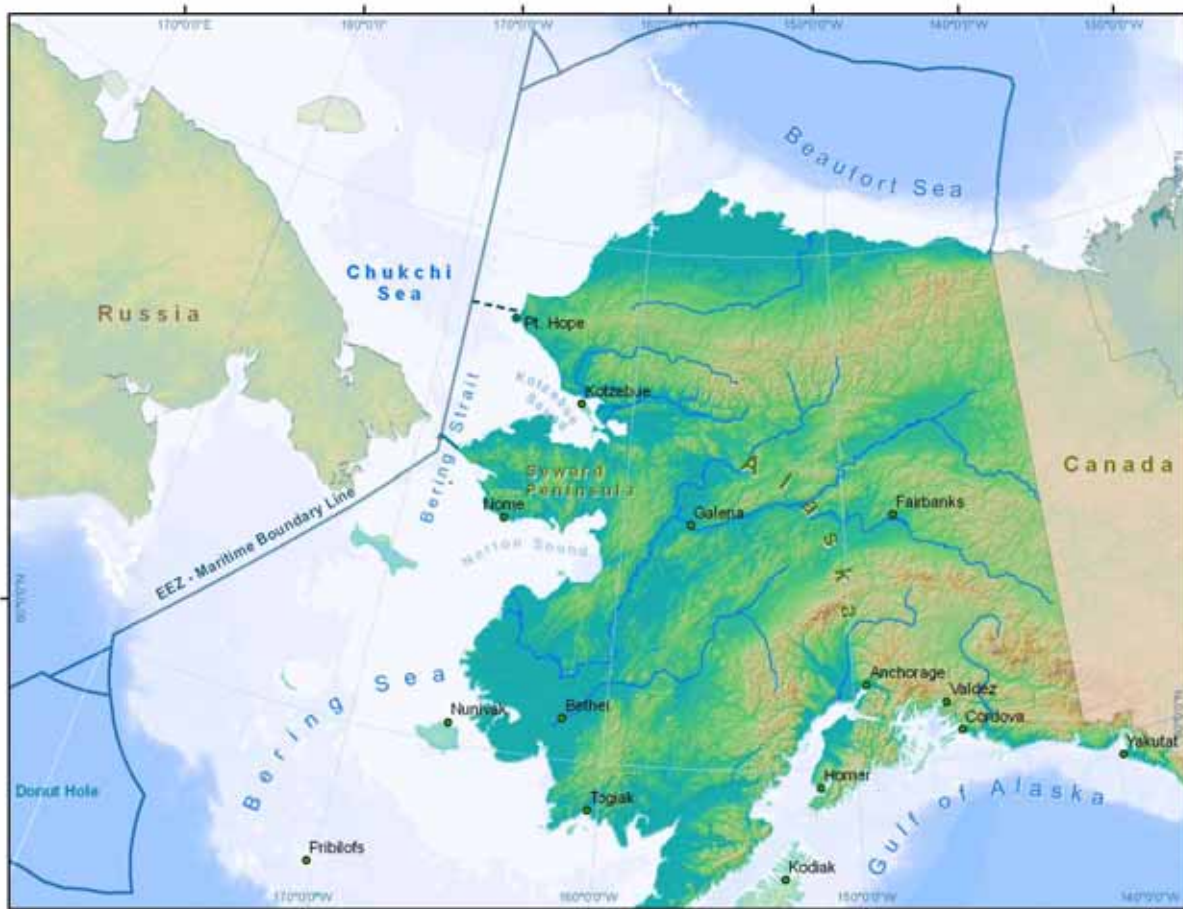
The Arctic Management Area as proposed in the draft Arctic FMP

A draft Arctic Fishery Management Plan and accompanying EA/RIR/IRFA were reviewed by the Council, AP, SSC, and Ecosystem Committee. The Council intends to adopt an Arctic FMP that closes the Arctic Management Area to commercial fisheries. The EA/RIR/IRFA contains an analysis of four alternatives, one of which is status quo, and two options for setting MSY, OY, and other conservation and management measures as required under MSA Section 303. After receiving these documents, the Council requested that staff address the comments from the SSC and Ecosystem Committee to the extent possible by the end of October 2008, and then release the preliminary draft Arctic FMP and EA/RIR/IRFA for public review. The Council noted that the SSC had concerns with some features of the options for specifying MSY and OY, and that additional time would be required to fully address these concerns. The Council also felt that public review and comments on these options would be helpful. The Council recommended that the updated analysis be reviewed with the SSC at the December 2008 meeting, and that the Council would review this package in December only if warranted. After the December 2008 meeting, and the remaining issues are addressed and incorporated into the draft FMP and EA/RIR/IRFA, the Council recommended a revised draft package again be sent out for public review. Final action is scheduled for the February 2009 meeting. Staff contact is Bill Wilson.