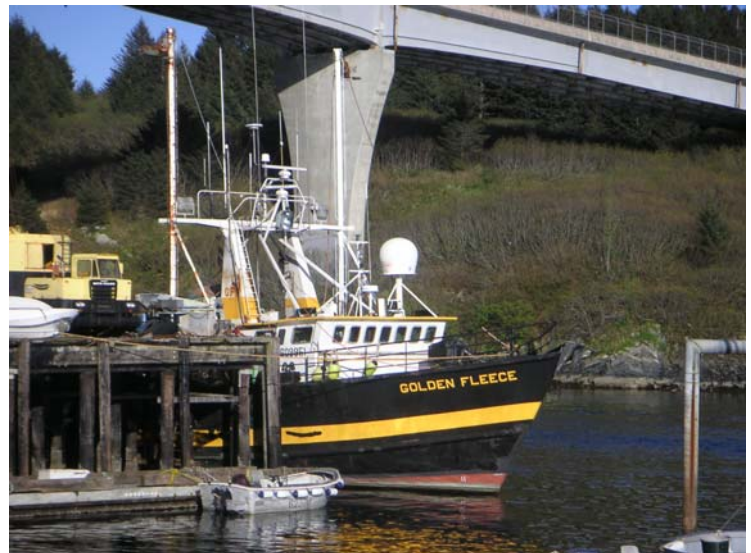
F/V Golden Fleece is one of the qualified CPs under Rockfish Pilot Program.

In addition, the Council requested that the proposed action to exempt non-AFA crab vessels from B season Pacific cod sideboards after November 1 (Action III) be removed from the current amendment package and bring back as a separate action in February. There are currently two alternatives under this action. The first alternative is status quo. The second alternative would lift sideboard restrictions from 1) vessels that have a GOA groundfish sideboard or 2) vessel that have a GOA Pacific cod sideboard. The new suboption would restrict the sideboard exemption to those years when a) 10%-30% of B season Pacific cod TAC remains unharvested and/or b) up to 0 – 5,000 mt of B season P. cod remains unharvested prior to November 1. Staff contact is Jon McCracken